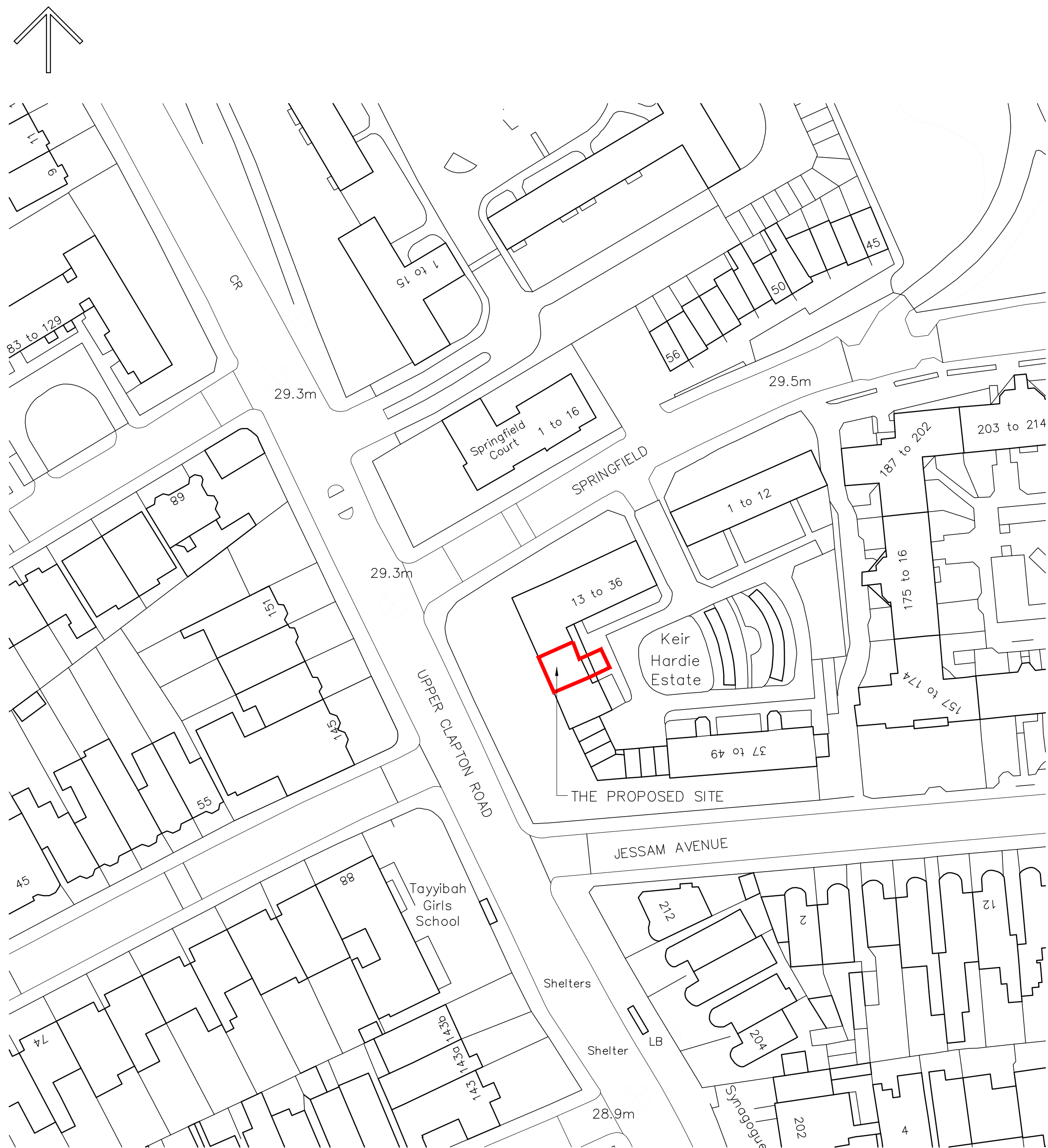
LOCATION PLAN SCALE 1:1250 @ A3

Notes DO NOT SCALE THIS DRAWING UNLESS USED FOR PLANNING PURPOSES. USE FIGURED DIMENSIONS ONLY CONTRACTORS ARE RESPONSIBLE FOR TAKING AND CHECKING SITE DIMENSIONS DESIGN COPYRIGHT IS VESTED IN THE ARCHITECT FROM WHOM CONSENT MUST BE OBTAINED FOR COPYING OR REPRODUCING THIS DRAWING