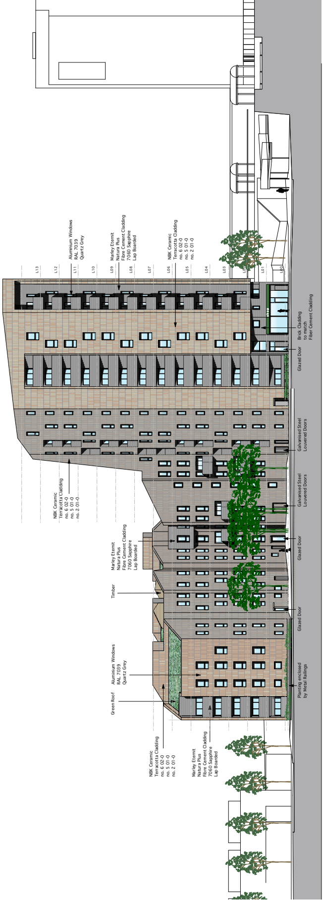
Berger Rd. Elevation